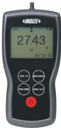
ISF-DF100A type A