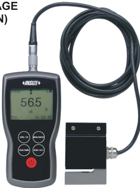
ISF-DF5KA type B