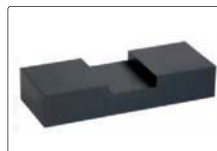
flat anvil for test block (included)