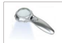
magnifier with LED (included)