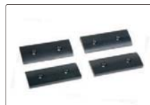
supports for cylinder or tube workpieces (included)