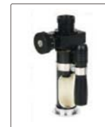
measuring microscope (included)