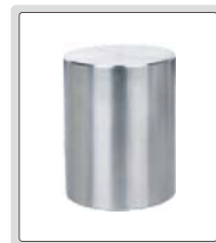
4kg weight block (optional) for ISH-S30D