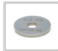
calibration block (included)