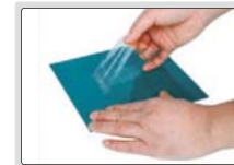
step 2: paste and remove the tape