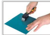
step 1: make grid cutting on surface