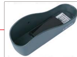
base with calibration block (included)