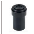
adapter 0.5X (optional)