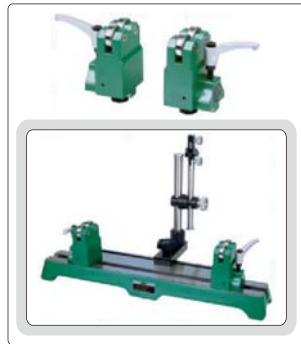
roller tailstocks (included)