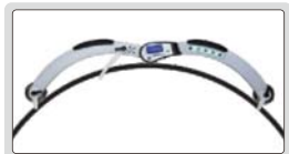
external diameter measurement