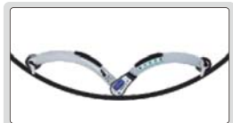
internal diameter measurement