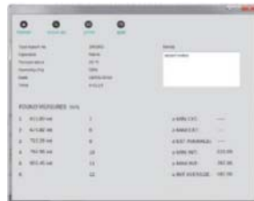
software (included), data output, save and print